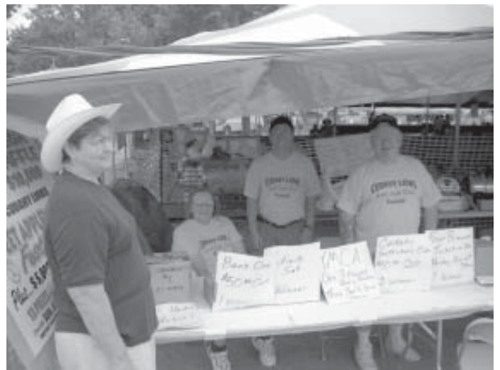
Cudahy Lions Fundraiser