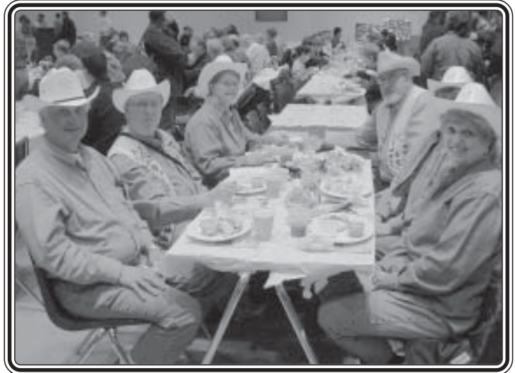
Waukesha Evening Ship Fundraiser