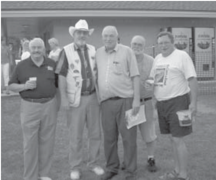
Big Foot Lions Fundraiser