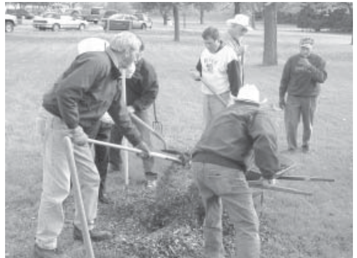
Fort Atkinson Lions Steak fry & Clean-up