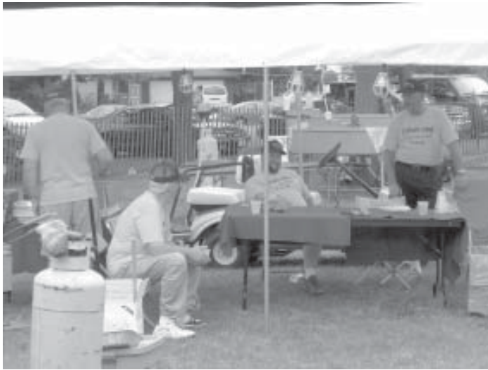
Cudahy Lions Fundraiser