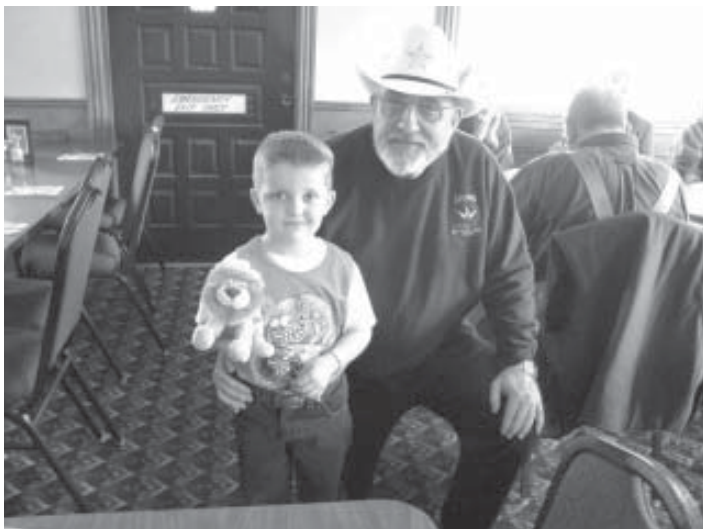
Delevan Lioness Pancake Fundraiser