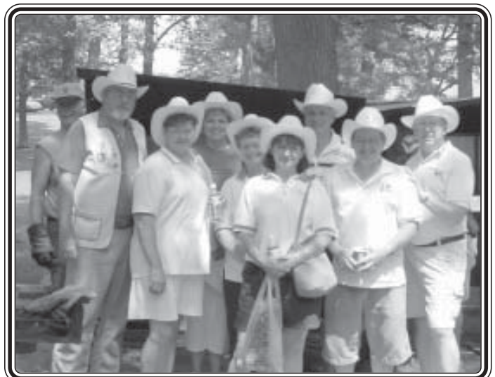
Wind Lake BBQ & Car Show