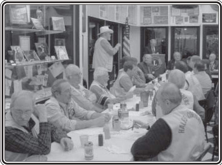
Region 2 Zone 1 meeting