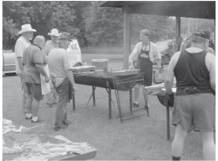
Burlington Lions Steak Fry