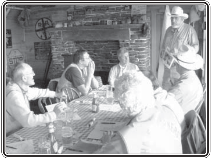
Hales Corners Lions meeting