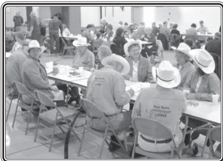
West Allis Pancake Breakfast