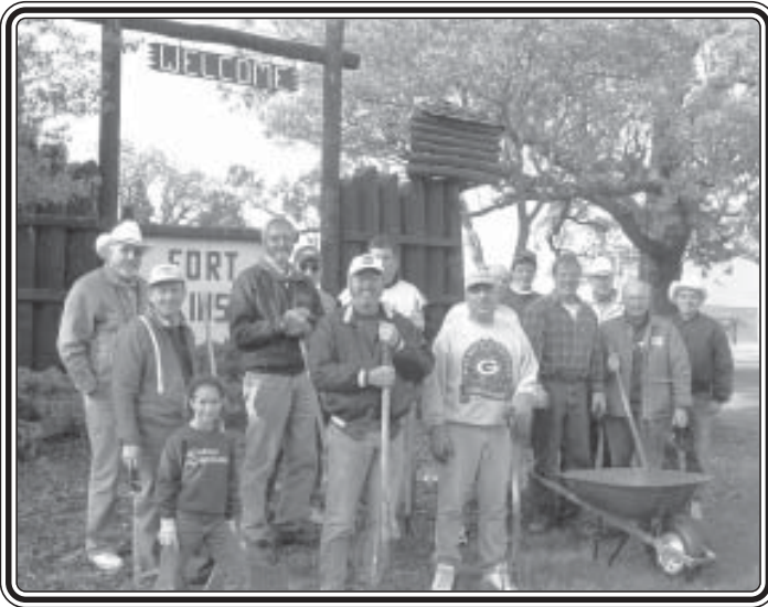
Fort Atkinson Lions Steak fry & Clean-up