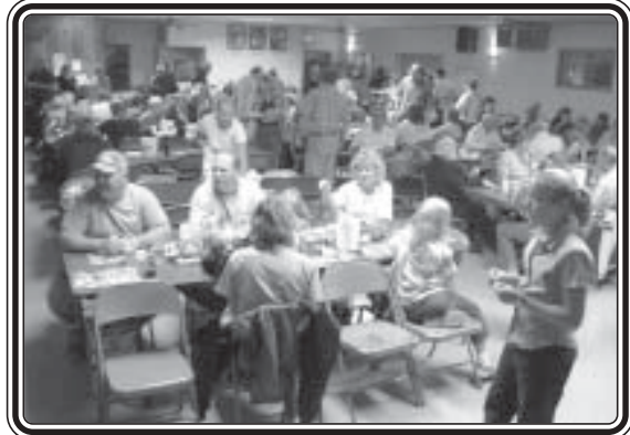
New Berlin Prospect Lions Have Successful Steak and Shrimp Fund-raiser