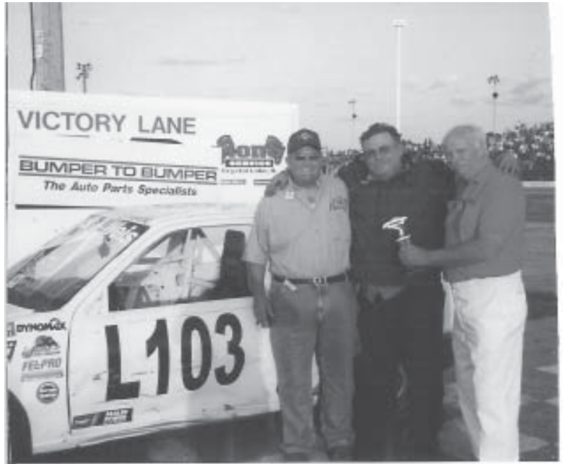
Winner receiving his trophy in Victory Lane