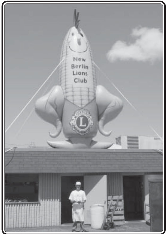
New Berlin Lions Had a successful State Fair Corn Roast Event. Many Thanks to the over 1200 volunteers helping with cooking, & selling corn to the State Fair crowd. Over $1,600 was collected in donations for Wisconsin Lions Foundation in special collection boxes at each sales booth.