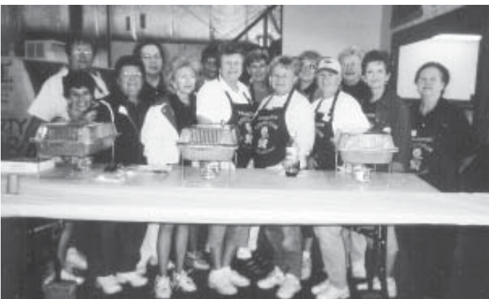
Burlington Lioness - Fly-In Breakfast - August 22, 2004