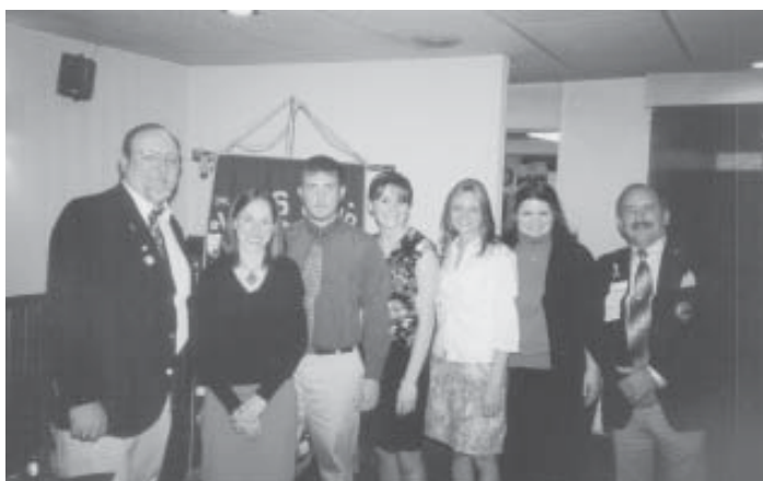
2003 Cudahy Lions Scholarship recipients. Scholarship awards in 2003 totaled $8500.00.