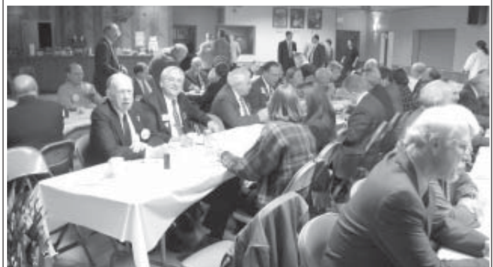
Members and guests socialize waiting for Call to Order