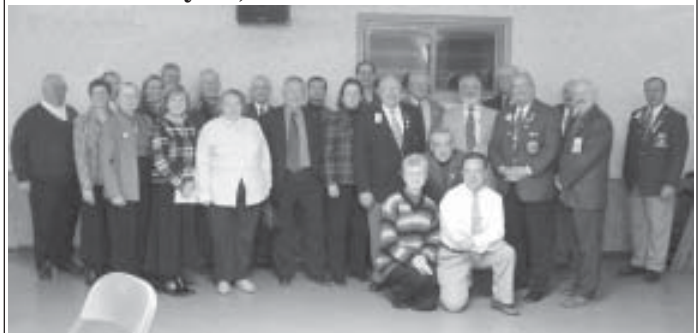
Above are recipients of $47,500.00 donations