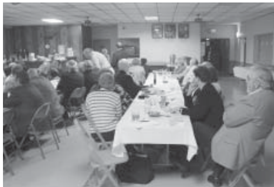
NB Lioness & Guests