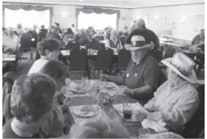
Delevan Lions host successful Corn beef and Cabbage dinner March 14, 200