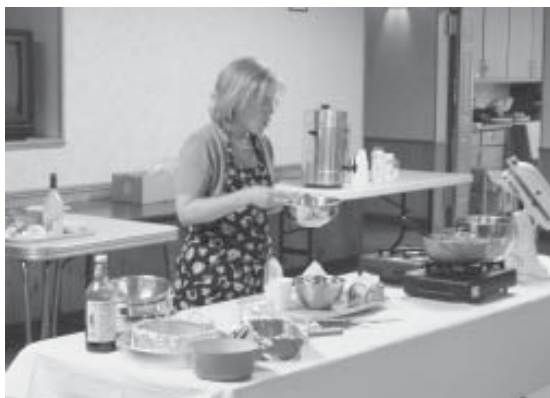
Demonstration on how to make Chocolate Cream Cake and Chocolate deserts.